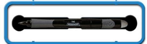
Dry Erase Pen Module