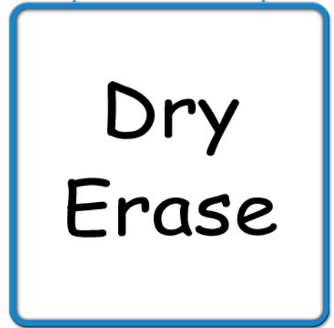
Large Dry Erase Module