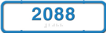
Room Number Module