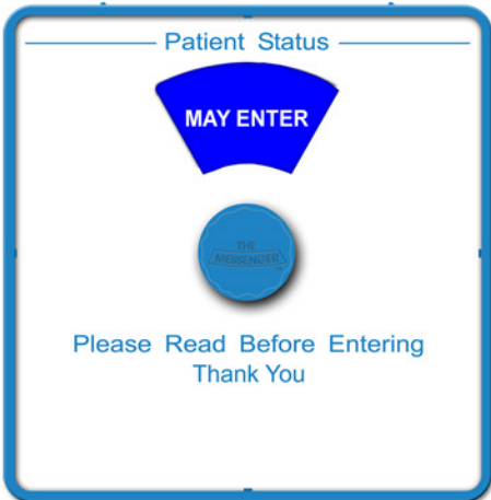
Wheel Message Module