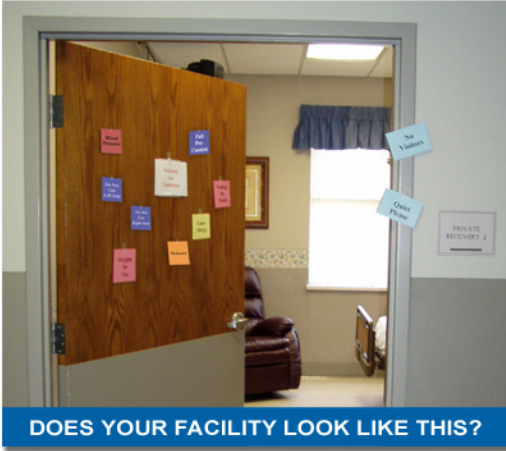
DOES YOUR FACILITY LOOK LIKE THIS?