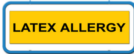
Small Dry Erase Module