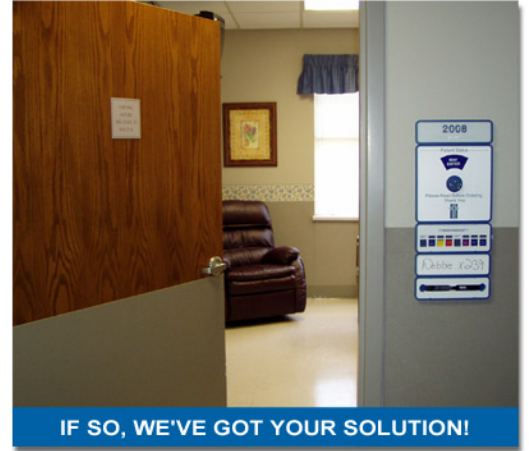
IF SO, WE'VE GOT YOUR SOLUTION!